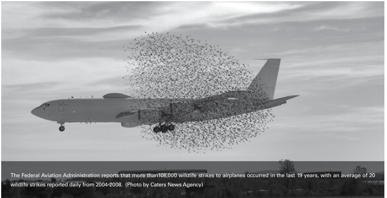
The Federal Aviation Administration reports that more than 108,000 wildlife strikes to airplanes occurred in the last 19 years, with an average of 20 wildlife strikes reported daily from 2004-2008.