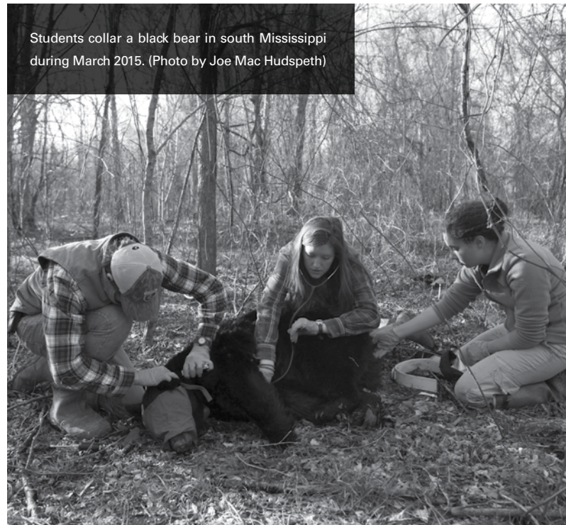
Students collar a black bear in south Mississippi during March 2015.

The scientists were testing how food supply, travel corridors