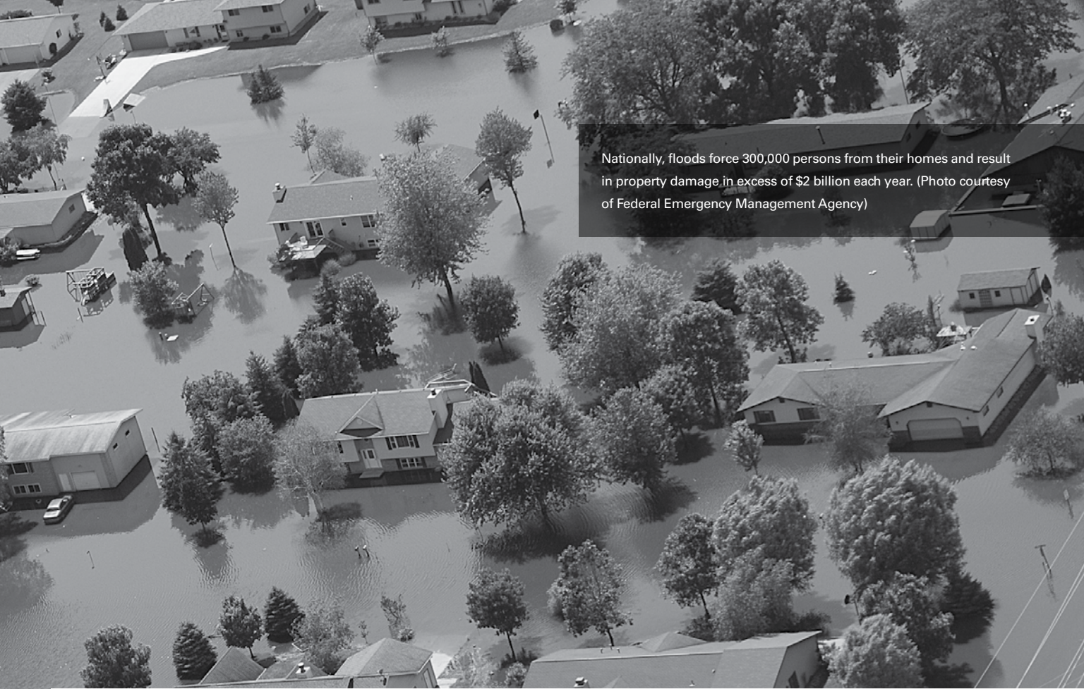
Nationally, floods force 300,000 persons from their homes and result in property damage in excess of $2 billion each year.

I N THE PAST FIVE YEARS, ALL 50 STATES HAVE EXPERIENCED floods or flash floods. Nationally, floods force 300,000 persons from their homes and result in property damage in excess of $2 billion each year.